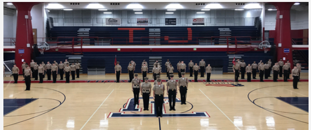
Last AMI held in person (2019)

It is held in person after 2 years, due to the pandemic. As it is coming up, cadets prepare their knowledge and performance for this event.