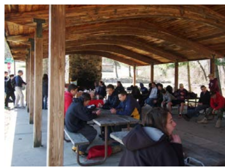
Cadets Hiking 10 Miles on the Appalachian National Scenic Trail from Harpers Ferry, WV to Gathland State Park, MD