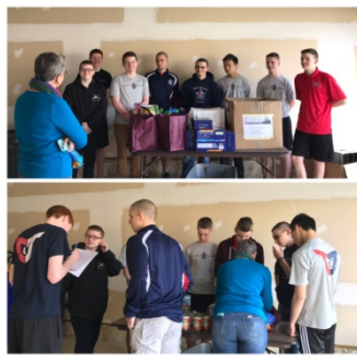
Left: Mission 10 Miler Cadet Volunteers Cheering for Runners Right: Cadet Volunteers Sorting Food for Blessings in a Backpack