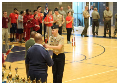
Patriot NJROTC Drill Team Competing at Area 5 Drill Championships Held at Bowie High School